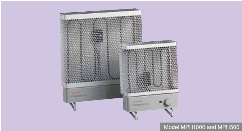
Model MPH1000 and MPH500

Compact, durable heaters purpose designed for reliable frost protection. Suited to a wide range of applications including lofts, sheds, greenhouses and conservatories.